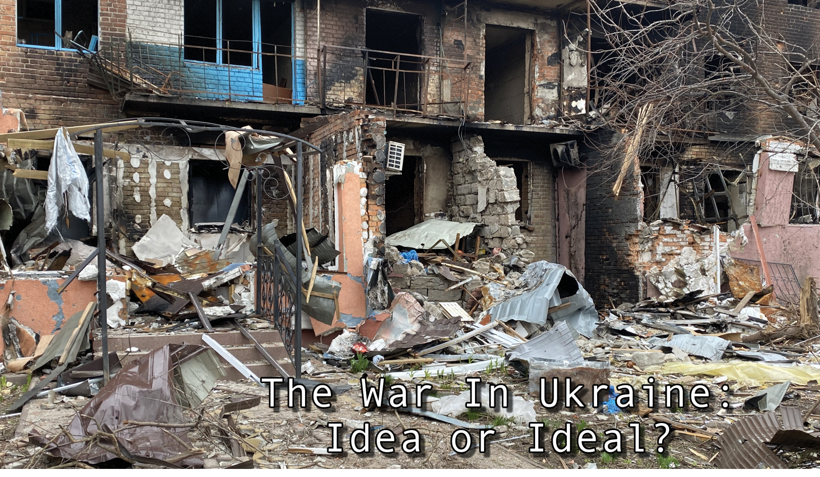
idea \setminus n 1 a : a transcendent entity that is a real pattern of which existing things are imperfect representations ... 2 : a visible representation of a conception : a replica of a pattern ... 3 b : an indefinite or unformed conception

ideal \ n 1 a : a standard of perfection, beauty, or excellence ... 2 : [exemplary] taken as a model ... 3 : practice that values subjective types or aspects that affirms preeminent value